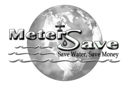
Save Water Save Money!

Please go to <u>www.metersave.org</u> By phone call 3-1-1, or 312-744-4H2O.